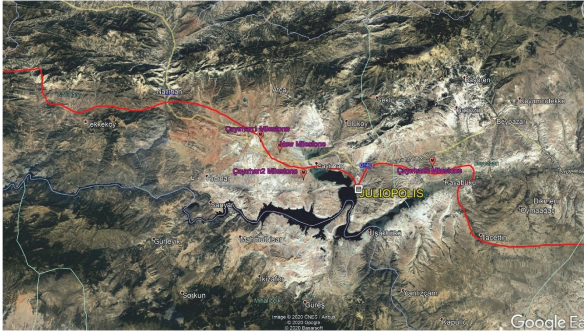
Fig. 1) The Milestones and Pilgrim's Road (Google Earth)