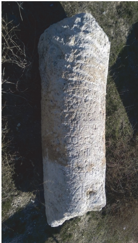
Fig. 5) No.2. Fragmentary Milestone