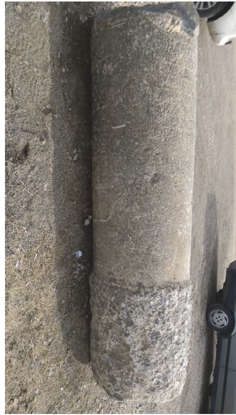
Fig. 4) No.1. Milestone from Caracallan Period