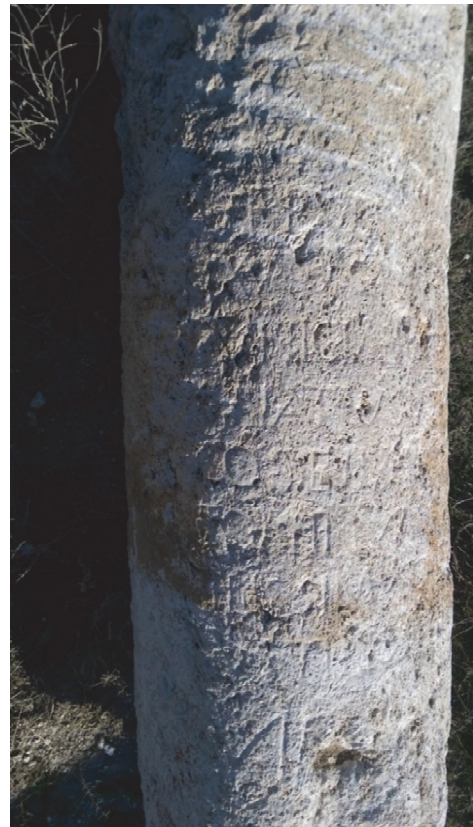
Fig. 6) No.2. Fragmentary Milestone