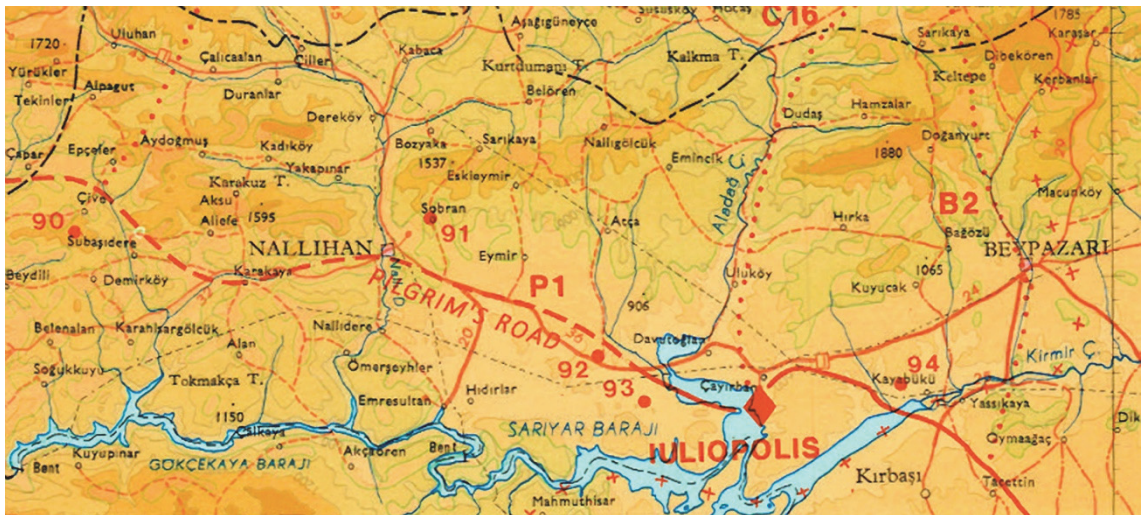
Fig. 2) The Pilgrim's Road and the milestones around Juliopolis (base map: French 2016, 49, Pontus et Bithynia: 3.4.3 Zonguldak Sheet)