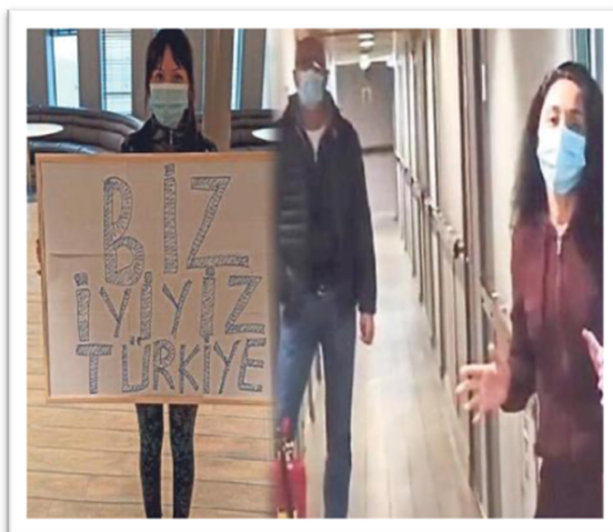
Figure a: Quarantine on board for seafarer

The author declared that there are no potential conflicts of interest with respect to the research, authorship, and/or publication of this article.