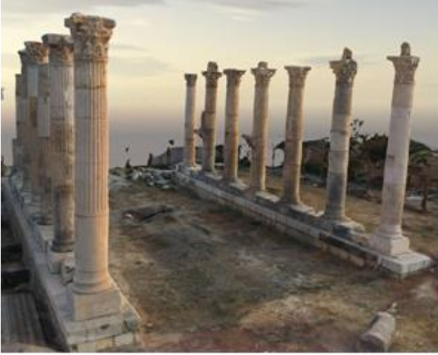
Figure 6: The resulting dense point clouds.