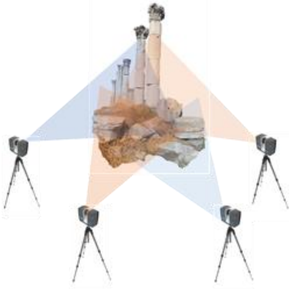
Figure 2: Terrestrial Laser Scanning (TLS) technique

Scans were made at 49 different station points determined in the study area. The number and location of the station points have been determined in a way that the area to be scanned can see one or more areas.