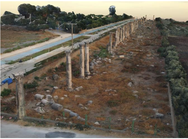
Figure 7: The resulting mesh model