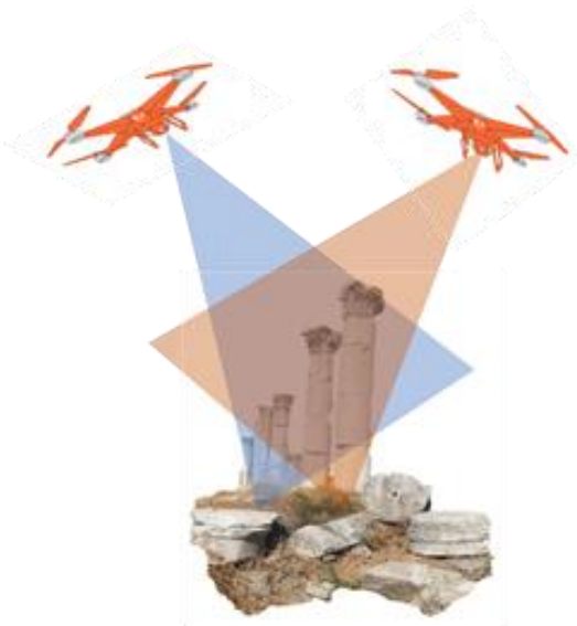
Figure 3: UAV Photogrammetry

Scans were made at 49 different station points determined in the study area. The number and location of the station points have been determined in a way that the area to be scanned can see one or more areas.