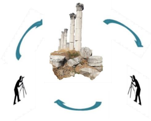
Figure 4: CrP Photogrammetry

Overlapping photographs were taken for CrP and UAV photogrammetry. For CrP 326 image data were collected for 78 UAV. Photo data were collected manually for CrP and automatically for UAV. Also, with Total-stations, target, and characteristic details were measured to transfer the result products created from different data collection methods both for registration and to the same scale and coordinate system.