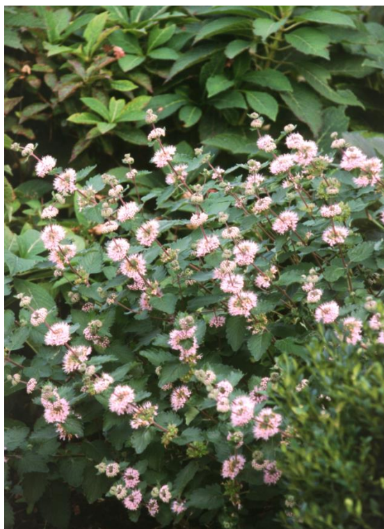
Figure 1. C. xclandonensis 'Durio' Pink Chablis™ growing in a landscape setting.

*: Correct isomer could not identified; RRI;Relative retention indices calculated against n -alkanes; % calculated from FID data; Identification method, t_{R_i} , identification based on the retention times of genuine compounds on the HP Innowax column; MS, identified on the basis of computer matching of the mass spectra with those of the Wiley and MassFinder libraries and comparison with literature data.