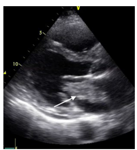
Figure 1: Large polymorphic clavicle type highly mobile formation in the left atrium with a size of 76x23mm (white arrow), prolapsing the annulus of the mitral valve and reaching the middle of the extended left ventricle.

Immunohistochemically, lymphoma cells were positively stained on CD20 (Figure 3), CD30 (Figure 3), MUM1, EBER (Figure 2), and had a high expression (80%) of ki-67. Cyclin-D1, CD10, BCL6, FOXp1, CD5, ALK, cMyc, and EMA were all negative. After excluding all other systemic manifestations, together with the morphological findings' patient was diagnosed with two distinct tumors: FA-DLBCL a primary cardiac lymphoma secondary to his initial diagnosis which was a cardiac myxoma.