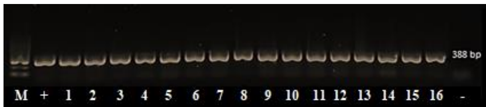
Figure 3. Images of gel electrophoresis of the hlyA gene of L. monocytogenes isolates. A) M: 100 bp DNA marker. +: Positive control. 1: KA 26/2. 2: KA 11/1. 3: KA 45/1. 4: KA 11/2. 5: KA 12/1. 6: KA 14/1. 7: KA 17/2. 8: KA 19/2. 9: KA 21/2. 10: KA 23/2. 11: KA 26/1. 12: KA 26/4. 13: KA 30/2. 14: KA 30/3. 15: KA 55/2. 16: KA 69/2. 17: KA 72/1. 18: KA 79/2. -: Negative control. B) M: 100 bp DNA marker. +: Positive control. 19: KA 89/2. 20: KA 90/1. 21: KA 95/1. -: Negative control