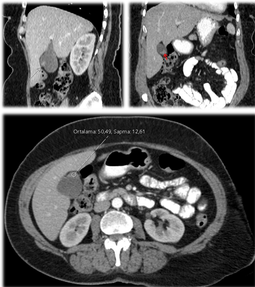
Figure 1(a)(b)(c): Images of the case on CT.

Histologically, the polypoid lesion consisted of gastric mucosa composed of fundic and pyloric glands. Other gallbladder mucosa demonstrated pyloric metaplasia and chronic cholecystitis findings.