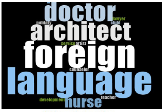
Girls' occupational aspirations

An interesting result was that both girls and their parents attached importance to economic security, while neither boys nor their parents did mention it. There are a number of possible reasons for this result such as gender role expectations and stereotypes, social gender inequality, and opportunity gap in the workplace for women (McMahon and Patton 1997). Additionally, due to some contextual factors such as educational inequalities for girls, especially for higher education, high dropout rates and low marriage age among girls, the lower rates of women's labor force participation of the region where the data collected (Geniş and Adaş 2011, Ardili 2015, Başkaya and Ünal 2017), both girls and their parents might have prominently emphasized this career value by assuming that an economic independence can warrant a secure future for the girls. Some evidence also suggested that women were more concerned with having a secure future and job security, particularly in collectivist cultures (Bu and McKeen