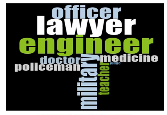
Parents of girls'occupational aspirations