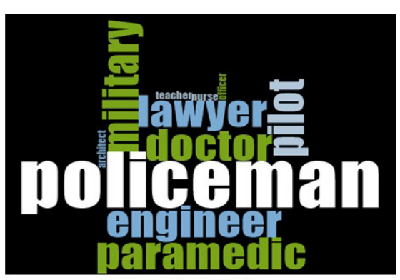
Boys' occupational aspirations