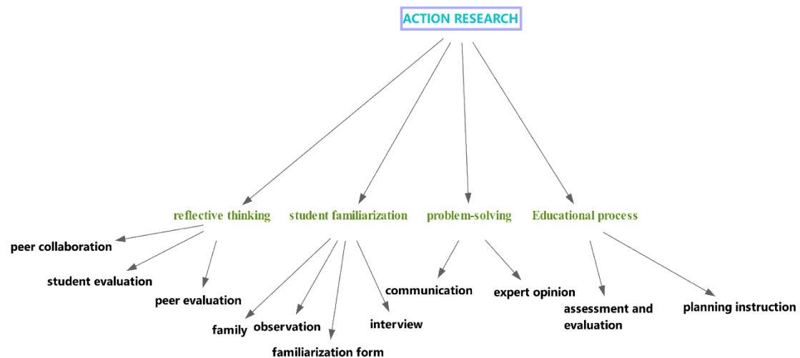
Figure 3. Hierarchical code model of using action research

According to Figure 3, the participants use action research in order to make evaluations about problem-solving, reflective thinking, student familiarization, and the education and training process in their classrooms.