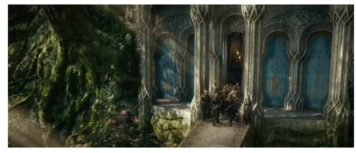
Figure 10. Entrance of the Woodland Realm (Screenshot from The Hobbit II by the authors, 00:48:01)

Jackson's cinematic adaptation of the Woodland Realm in The Hobbit movie (2013) introduces several key changes and elaborations compared to Tolkien's novel. These changes significantly impact the portrayal of the Woodland Realm's exterior, its relationship with the environment, and its entrance (Figure 10).