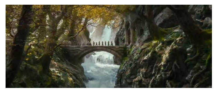
Figure 11. Woodland Realm's Entrance and Waterfall (Screenshot from The Hobbit II by the authors, 00:47:56)

In particular, Jackson's adaptation (2013) introduces a visually striking waterfall entrance (Figure 11) that was not described in the novel. This cinematic choice adds a dynamic element to the storytelling and enhances the viewer's experience.