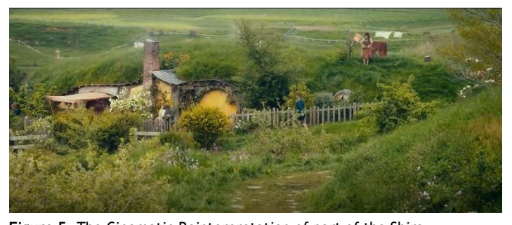
Figure 5. The Cinematic Reinterpretation of part of the Shire (Screenshot from The Hobbit I by the authors, 00:17:39)

Jackson's cinematic interpretation (Figure 4) is distinguished by its close attention to detail in presenting Bag End's exterior. The adaptation adeptly showcases a spectrum of architectural elements that collectively define the perfect outer visage. Key features, such as the round doorway, the verdant thatched roof, and the stone-clad walls, are integral to establishing and communicating its unique architectural character. These compositional elements are intentionally curated to impart an indelible and aesthetically memorable facade. Notably, the faithful replication of the iconic round door from the novel visually represents the whimsical and hospitable ambiance of Tolkien's literary narrative. The round door's ornate woodwork further reinforces the themes of comfort and homeliness. Additionally, the exterior harmoniously melds with the luxuriant. sylvan backdrop of the Shire, thereby accentuating the mutual relationship between architectural craftsmanship and the natural milieu. The spatial layout of the Shire, a region of several hobbit villages (Figure 5), and the positioning of Bag End among other of community hobbit-holes convey a sense interconnectedness. The winding path leading to the round door accentuates its architectural integration with the natural surroundings and creates a pastoral atmosphere.