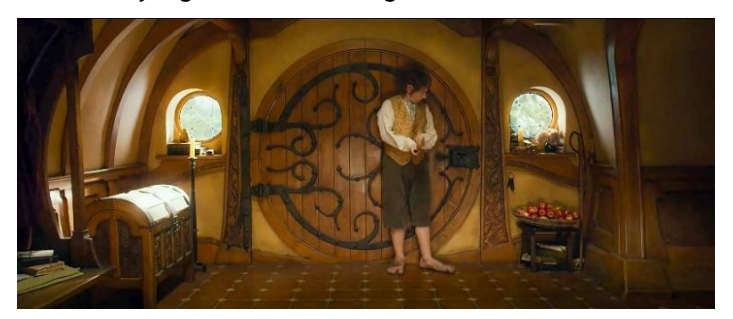
Figure 6. A Shot from the Interior of Bag-End (Screenshot from The Hobbit I by the authors, 00:16:50)

thoughtful architectural composition but also an environment meticulously organized and inviting.