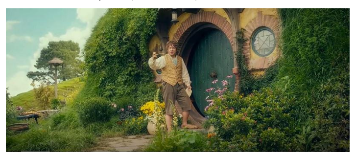
Figure 4. The Cinematic Reinterpretation of the Hobbit-hole (Screenshot from The Hobbit I by the authors, 00:16:44)

evoking sentiments of snugness and distinctiveness in the reader's mind. As such, it emerges as a pivotal motif in the broader narrative tapestry of The Hobbit, which concerns a longing for home in later chapters (Olsen, 2012).