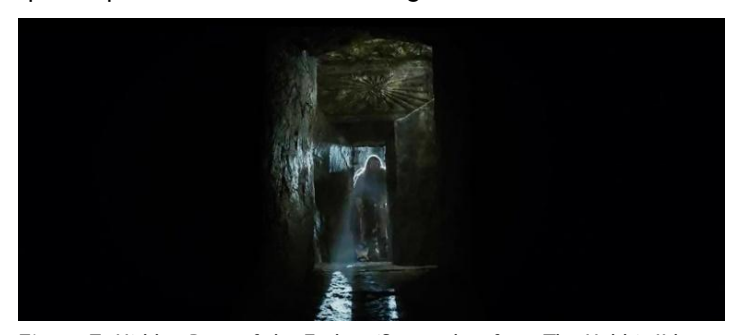
Figure 7. Hidden Door of the Erebor (Screenshot from The Hobbit II by the authors, 02:05:11)

Through Tolkien's aptitude, the passage highlights the author's adroitness in delivering an intricate and imaginative description of the hobbit-hole's spatial character. It presents architectural attributes that are instrumental in amplifying our understanding of the hobbit's abode and its symbiotic relationship with the natural surroundings. The selection of materials, spatial arrangement, and architectural attributes underscores the ambience of snugness and distinctive charm permeating this spatial sphere within the overarching narrative canvas.