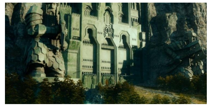
Figure 8. Main Façade of the Erebor

The interaction between Smaug and the architectural aspect of the secret entrance is crucial while Smaug's presence is significant, suggesting that he has had ample time to discover this entrance. Nevertheless, the text hints that Smaug's large size, particularly after consuming numerous dwarves and men, prevents him from using the entrance. This illustrates the interplay between the physical features of a character and the architectural design of the entrance.