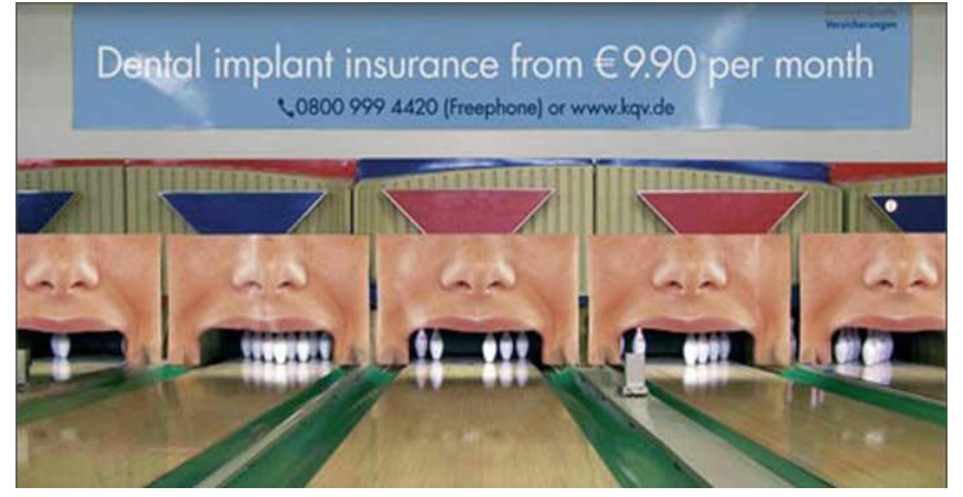
Figure 19 KQV Insurance Service Guerrilla Marketing Example

The advertisement of KQV insurance company in Figure 19 was evaluated in several dimensions within the framework of different grammatical and visual expression concepts. The advertisement introduces dental implant insurance and states that it is offered at prices starting from 9,90 € per month. A telephone number and a website address are given as contact details.