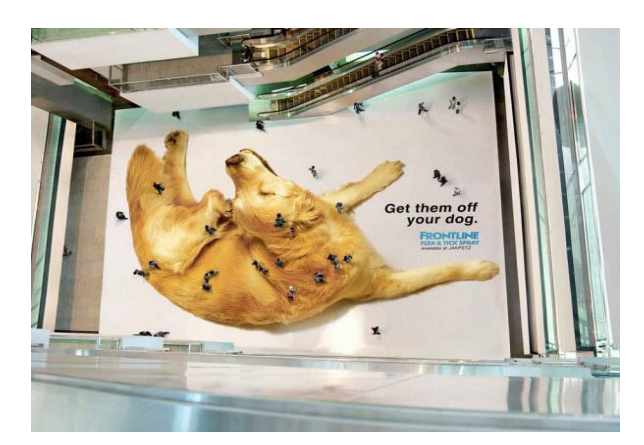
Figure 4 Frontline Guerrilla Marketing Example

The advertisement of the Frontline brand in Figure 4 was evaluated within the framework of different grammatical and visual expression concepts. The denotation of the advertisement is the depiction of a large golden retriever dog lying down and scratching.