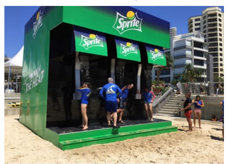
Figure 14 Sprite Guerrilla Marketing Example

The advertisement of the Sprite beverage brand in Figure 14 was evaluated in several dimensions within the framework of different grammatical and visual expression concepts. The surface meaning of the advert is a Sprite stand designed as a shower cabin on the beach, and people seem to be taking a shower from this cabin. This situation evokes cooling off with Sprite in summer. The connotation emphasises that Sprite is refreshing; the shower cabin symbolises the drink's freshness, and the beach and water suggest cooling off in summer. Metaphorically, the advert states that the refreshing effect of Sprite is 'like taking a shower'; the idea that the drink is refreshing is likened to the freshness of taking a shower. There is also a metonymic expression; the Sprite logo is a metonymy representing the brand, and the logo on the shower cabin evokes the Sprite drink and symbolises the brand. Although the advertisement does not have a written message in linguistic or verbal communication, the 'Sprite' script and logos communicate the brand name and identity. In visual or imagery communication, the shower cabin symbolises the drink's freshness, while the beach and an environment where people have a pleasant time imply that Sprite is a preferred drink in summer. The advert appears to be an event on a natural beach with real people, suggesting that Sprite is designed to reflect the consumer experience.