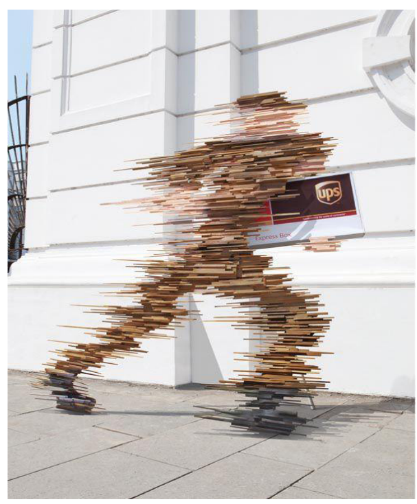
Figure 16 UPS Logistics Guerrilla Marketing Example

The advertisement of the UPS cargo brand in Figure 16 uses a creative visual to emphasise the fast and efficient delivery service of the UPS cargo company. The advertisement was evaluated in several dimensions within the framework of different grammatical and visual expression concepts. In a straightforward sense, the visual shows many packages forming a rapidly moving figure. This means that the parcels are physically transported and fast delivery is emphasised. In a connotative sense, the figure represents a person, symbolising UPS's ability to deliver quickly to customers. The use of metaphor implies that they offer a service beyond human carrying capacity, with the packages forming a human figure. Metonymy is when only one part of the UPS brand (the brand logo and colours) represents the whole company; in this advertisement, the UPS logo and the typical brown colours associated with the brand represent the whole company.