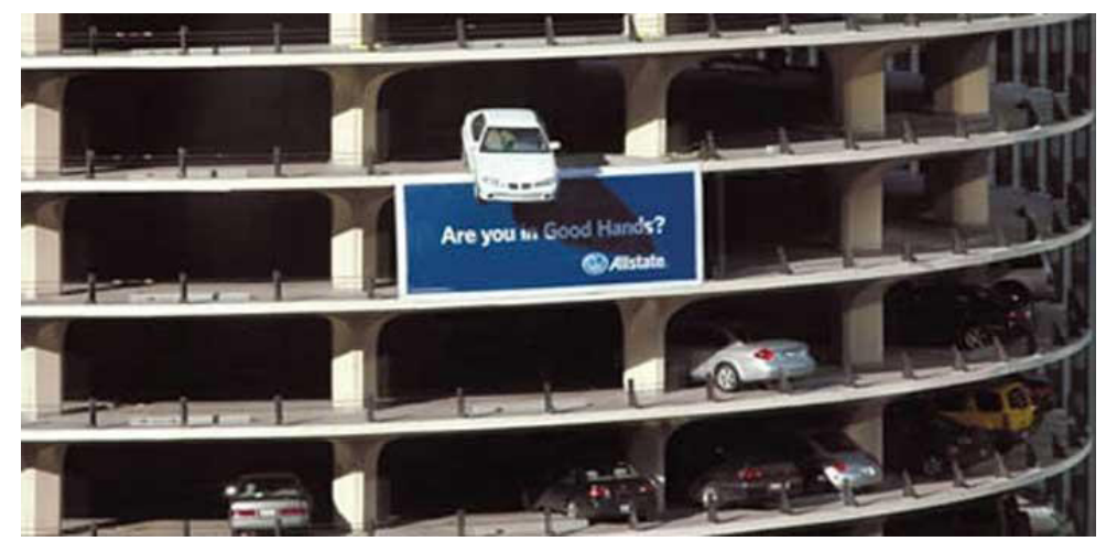
Figure 20 Allstate Insurance Service Guerrilla Marketing Example

The fact that the advertisement takes place in a realistic car park structure emphasises the real-life importance of the services offered by the insurance company to the viewers. This analysis shows how the advertisement is an engaging guerrilla with different communication layers and meanings. The advertisement conveys a strong message by using both visual and verbal elements.