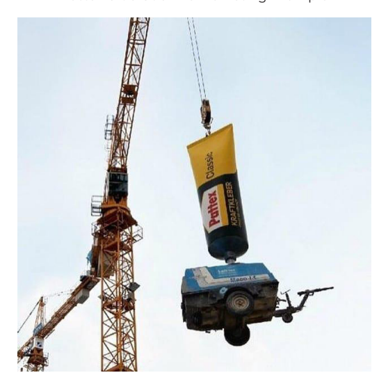
Figure 6 Pattex Glue Guerrilla Marketing Example

The advertisement of the Pattex adhesive brand in Figure 6 was evaluated within the framework of different grammatical and visual expression concepts. The image shows a Pattex brand adhesive hanging from a crane hook, making it look like an automobile is glued underneath. This indicates the extraordinary adhesive strength of the adhesive. As a connotation, the ad implies that the adhesive is strong enough to hold small and heavy objects. This creates a positive impression of the reliability and performance of the product. As a metaphor, the exaggerated scenario used in the advertisement emphasizes that the adhesive is "strong enough to hold the car in the air". As a metonymy, the automobile and construction equipment used in the visual represent the power and industrial use of the adhesive. As a linguistic message, although there is no direct verbal communication in the visual, the brand name "Pattex" and its recognition provide linguistic communication about the product itself.