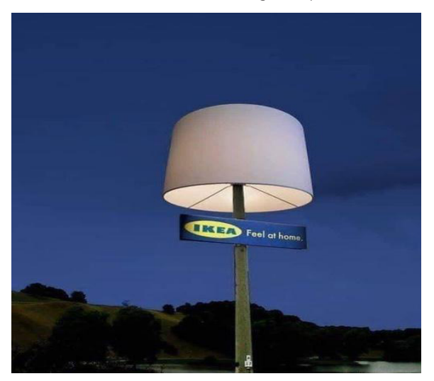
Figure 15 IKEA Guerrilla Marketing Example

The advertisement of the IKEA furniture brand in Figure 15 was evaluated in several dimensions within the framework of different grammar and visual expression concepts. The linguistic/verbal message part of the advertisement includes the phrase 'IKEA Feel at home.' In its direct meaning, this phrase means 'Feel at home at IKEA' and emphasises the comfort and convenience offered by IKEA.