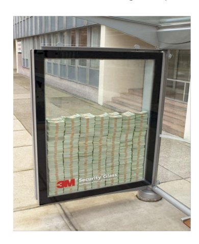
Figure 5 3M Guerrilla Marketing Example

As a connotation, the large amount of money behind the glass symbolizes wealth and security. The use of this glass suggests that valuable assets can be protected. Metaphorically, money represents something of value or needs to be protected, and the glass represents the barrier between valuables and potential threats.