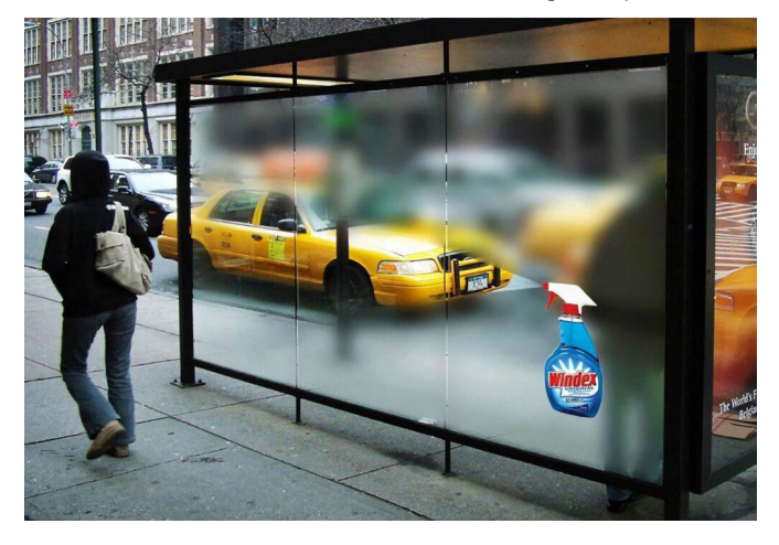
Figure 1 Windex Glass Cleaner Guerrilla Marketing Example

In the Windex advertisement in Figure 1, several dimensions were evaluated within the framework of different grammatical and visual expression concepts. The denotation of the ad is to show how well Windex glass cleaner cleans glass surfaces. The ad has a simple and clear message: "Clean your windows with Windex".