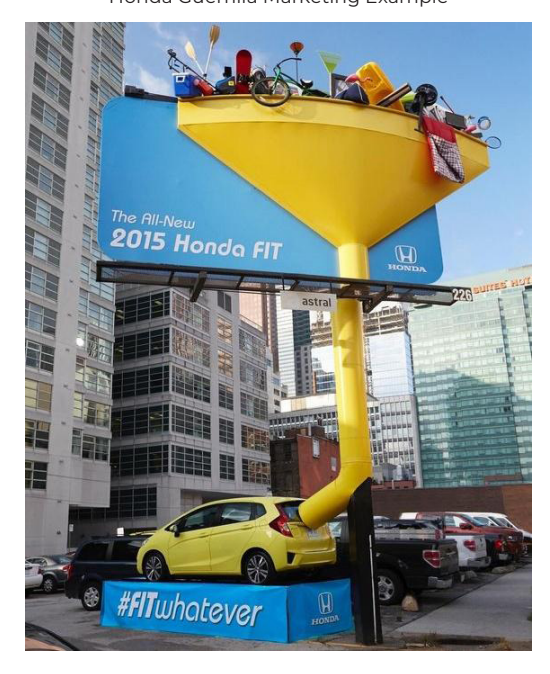
Figure 12 Honda Guerrilla Marketing Example

The advertisement in Figure 12, which belongs to the Honda Automobile brand, was evaluated in various dimensions within the framework of different grammatical and visual expression concepts. The advertisement shows various items poured from a large 3D funnel model into a yellow 2015 Honda Fit car. This representation suggests that the car is suitable for a comprehensive lifestyle. The variety of items poured from the funnel implies that the Honda Fit suits different lifestyles. It also emphasises the width of the vehicle despite its small appearance. The funnel symbolises how different aspects of life 'fit' into this car. The items associated with different activities represent an active and varied lifestyle compatible with the Honda Fit. The linguistic communication of the advert provides direct information about