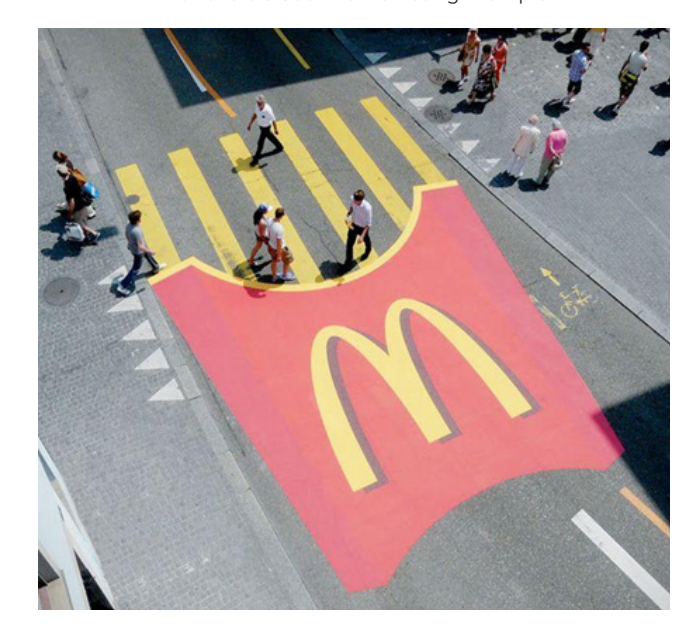
Figure 17 McDonald's Guerrilla Marketing Example

The McDonald's French fries advertisement in Figure 17 was evaluated in several dimensions within the framework of different grammatical and visual expression concepts. The image is painted so that a pedestrian crossing resembles a McDonald's French fries box. The pedestrian crossing seems to symbolise McDonald's French fries, and this symbol implies that going to McDonald's is as expected and simple as crossing the street.