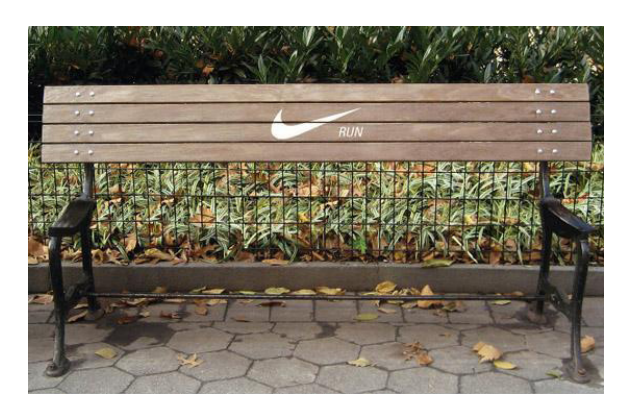
Figure 10 Nike Guerrilla Marketing Example

The advertisement of the Nike brand in Figure 10 was evaluated within the framework of different grammar and visual expression concepts. The bench in the visuals is equipped with the word 'RUN', the lettering, and Nike's famous Swoosh logo. In a literal sense, this appears to be a seat. However, in its connotation, the word 'RUN', associated with Nike's brand identity, evokes movement, action and running. The image of the Nike brand associated with energy and sport constitutes the connotation here. Metaphorically, the bench evokes running instead of sitting and has become a symbol for running, in line with Nike's slogan 'Just Do It'. Regarding metonymy, the bench, a fixed object usually associated with resting, is used instead of running as an activity. In the linguistic/verbal message dimension, the word 'RUN' functions as a direct command or suggestion and the advert encourages the target audience to think about running.