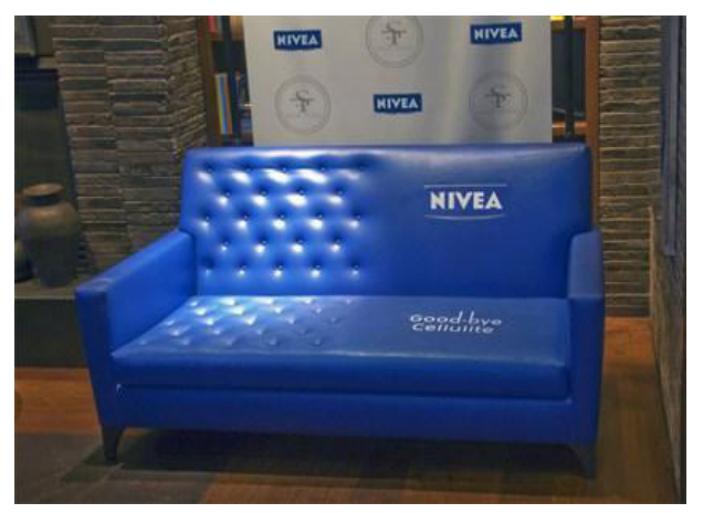
Figure 2 NIVEA Cream Guerrilla Marketing Example

The advertisement of the NIVEA brand in Figure 2 was evaluated in several dimensions within the framework of different grammatical and visual expression concepts. Denotation refers to the surface meaning of the advertisement in the image. This advertisement has a blue sofa with the "NIVEA" logo. In denotation, it seems to represent a product of the NIVEA brand.