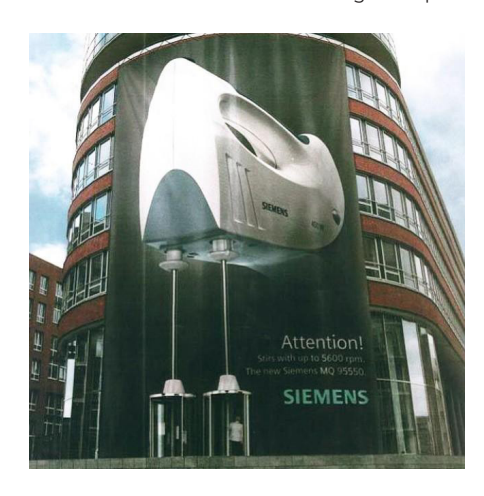
Figure 7 Siemens Mixer Guerrilla Marketing Example

The advertisement of the Siemens mixer in Figure 7 was evaluated within the framework of different grammatical and visual expression concepts. At the centre of the advertisement is a large Siemens mixer model, which is depicted as wrapped around a cylindrical building with glass windows.