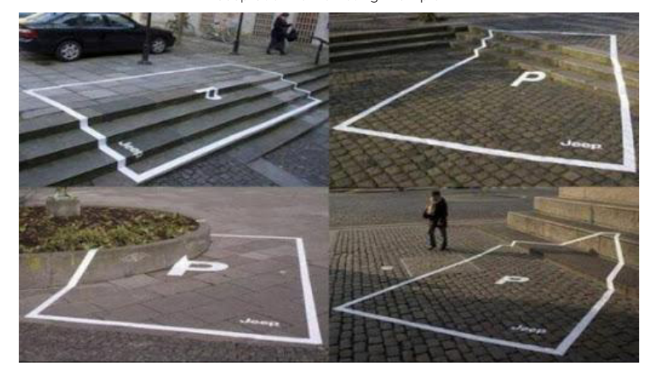
Figure 11 Jeep Guerrilla Marketing Example

The white lines drawn on the sides of the stairs can be seen as a coded visual message emphasising that the Jeep is a vehicle that can navigate complex