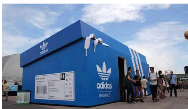
Figure 9 Adidas Shoes Guerrilla Marketing Example

The advertisement of the Adidas brand in Figure 9 was evaluated within the framework of different grammar and visual expression concepts. The image shows a structure resembling an Adidas shoe box. As a connotation, the giant shoe box implies that Adidas offers a wide range of products or 'big' experiences in its stores. The building or structure is a metaphor for a space with Adidas products inside. The shoe box represents the Adidas brand and its products.