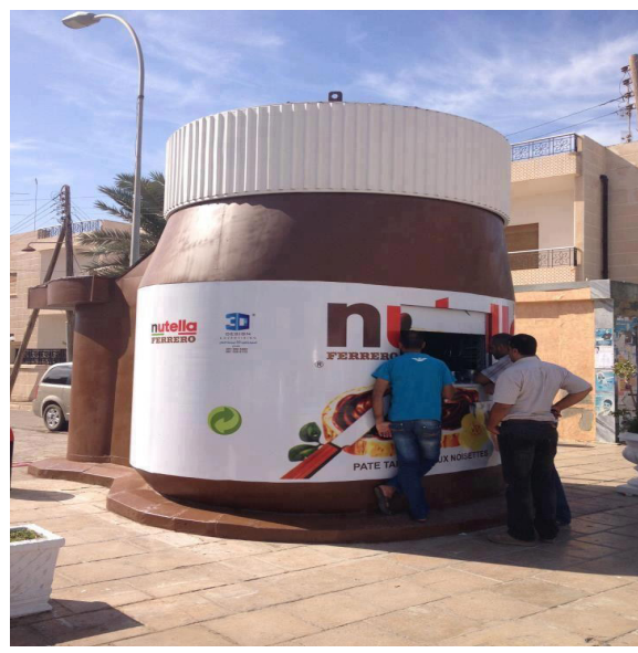
Figure 13 Nutella Guerrilla Marketing Example

The advertisement in Figure 13, which belongs to the Nutella food brand, was evaluated in various dimensions within the framework of different grammatical and visual expression concepts. The advertisement shows a structure resembling a vast Nutella jar. This image carries the meaning of abundance or generosity associated with the brand. The building, designed in the shape of a Nutella jar, can be seen as a metaphor for the product being an integral part of people's daily lives. The giant Nutella jar represents not only the product but also the brand and its place in the food industry. The writings on the jar communicate through language. The building design symbolises Nutella and shows that it is a place where Nutella products can be purchased or consumed. The similarity of the Nutella jar to an actual product provides direct visual communication. The advert also shows the main brand elements such as 'Ferrero'. The setting appears in a city area with buildings and expresses reality.