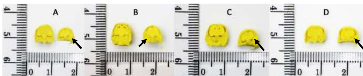
Figure 2. Small brain of the fetus found in (A) control, (B) WESAL 100 mg/kg bw, (C) WESAL 400 mg/kg bw, and (D) WESAL 1000 mg/kg bw group; WESAL : Water Extract of Sonchus arvensis - Anredera cordifolia Leaves