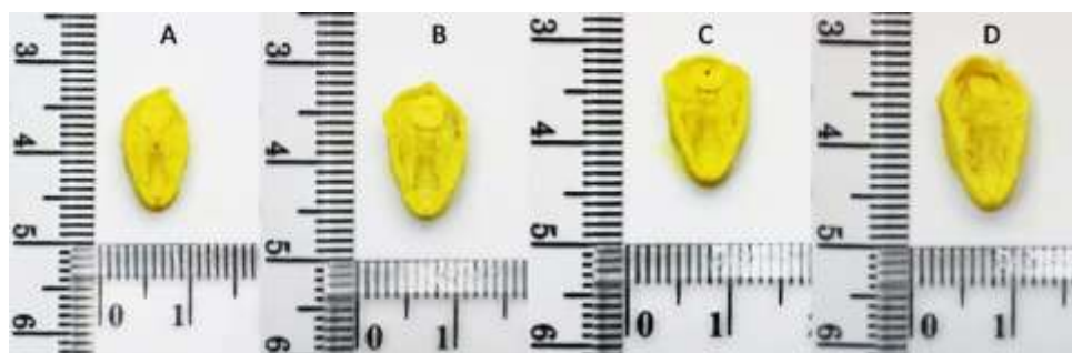
Figure 2. Normal palate of the fetus of (A) control, (B) WESAL 100 mg/kg bw, (C) WESAL 400 mg/kg bw, and (D) WESAL 1000 mg/kg bw group; WESAL : Water Extract of Sonchus arvensis - Anredera cordifolia Leaves

Hc: hidrocephalus; Ey: eye; Uj: upper jaw; Hr: heart; Lv: liver; Kd: kidney; Tt/Ov: testicles/ovary; Ln: lung; Fl: forelimb; Hl: hindlimb; Tl: tail; WESAL : Water Extract of Sonchus arvensis - Anredera cordifolia Leaves