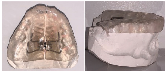
Figure 1. The modified acrylic bonded maxillary expansion appliance which has occlusal coverage of all the maxillary teeth

BBT was evaluated considering a previous study (9). Root length was determined as the distance from the horizontal reference line which was made at the radiographic level of CEJ to the root apex. Two points