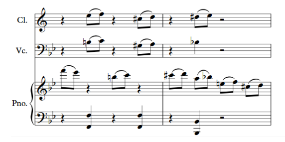
Figure 19: Ludwig van Beethoven - Trio for Clarinet, Cello and Piano in Bb Major, Op. 11, mvt. 3: Var. VI, mm. 1-4