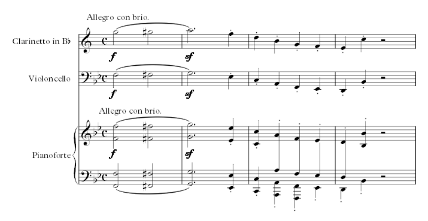
Figure 1: Ludwig van Beethoven - Trio for Clarinet, Cello and Piano in Bb Major, Op. 11, mvt. 1, mm. 1-4 Reference: (Beethoven, 1864: 1)

Measures 72-76 (Figure 2), and 209-213 are among the sections, where the ensemble playing between clarinet and cello is important. In these sections, there are slurs that continuously connect 2 different 8th notes. The beginning of each slur coincides with the weak beat of the measure, instead of the strong beat. Therefore, these slurs should be performed carefully. While listening to each other, the clarinet and cello players should make the separation of the slurs simultaneously and clearly.