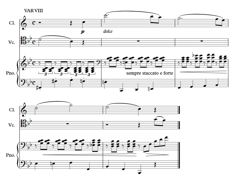
Figure 21: Ludwig van Beethoven - Trio for Clarinet, Cello and Piano in Bb Major, Op. 11, mvt. 3: Var. VIII, mm. 4-8

According to Terence, the crescendo (increasing the volume) and decrescendo (decreasing the volume) effects in the second half of this variation is meant to create a "more passionate effect, but without much success" (Terence, 2013: 358).