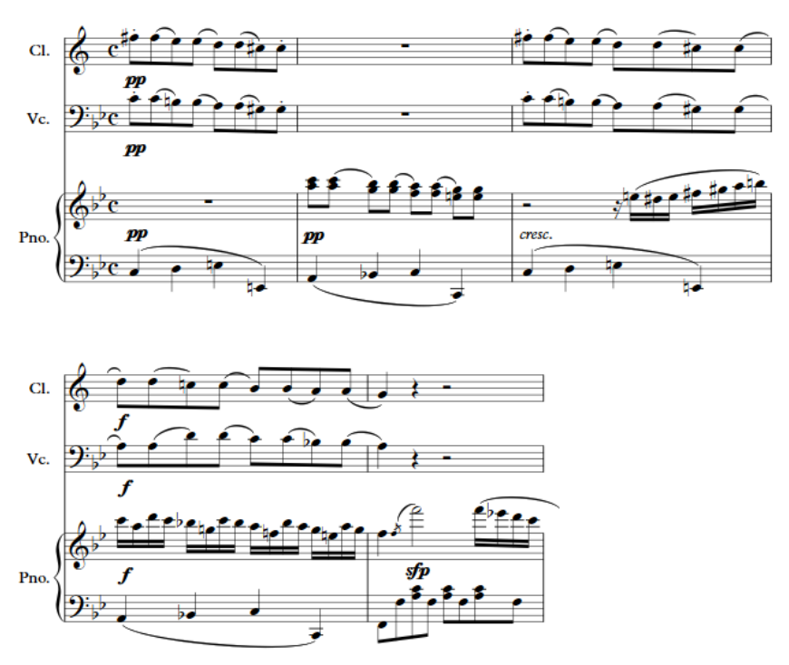
Figure 2: Ludwig van Beethoven - Trio for Clarinet, Cello and Piano in Bb Major, Op. 11, mvt. 1, mm. 72-76