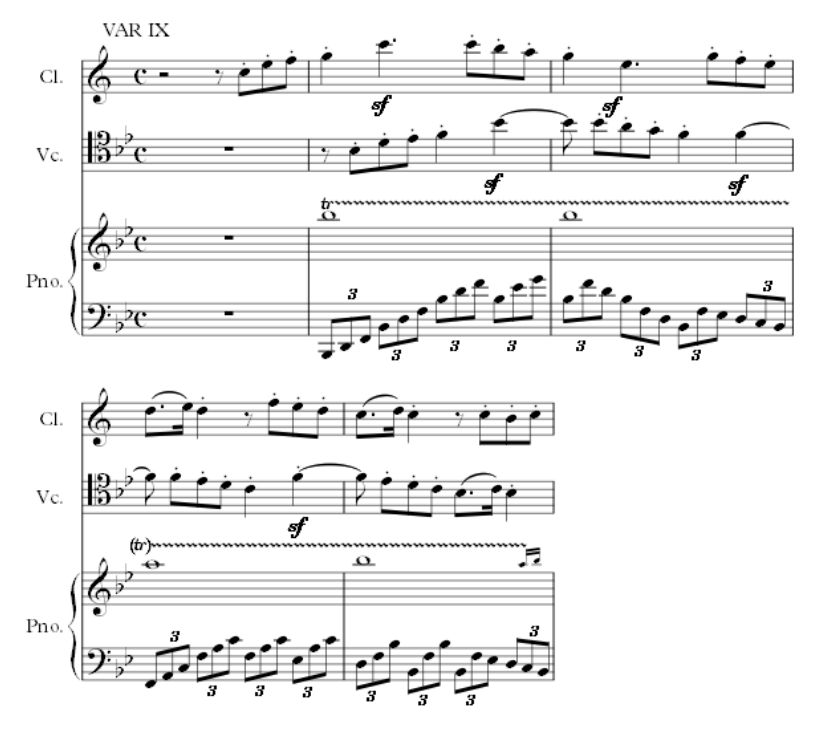
Figure 22: Ludwig van Beethoven - Trio for Clarinet, Cello and Piano in Bb Major, Op. 11, mvt. 3: Var. IX, mm. 4-8

Since the cello and clarinet parts play the same theme in a canon, the two players should make sure to play the theme in the same lively and joyful style. Also, in order to keep the canon intact, the players should especially be careful about the length of the slurred notes in the cello part and the dotted quarter notes in the clarinet part, and make sure that they do not come in late for the note that follows.