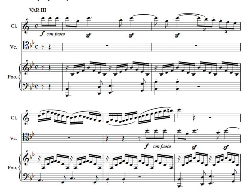
Figure 15: Ludwig van Beethoven - Trio for Clarinet, Cello and Piano in Bb Major, Op.11, mvt. 3: Var. III, mm. 1-5

4, while piano continues to accompany. In the cello part, there are staccato triplets at the end of the theme, instead of the 16-note legato passages in the section played by clarinet.