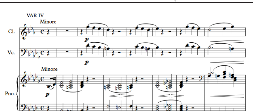
Figure 18: Ludwig van Beethoven - Trio for Clarinet, Cello and Piano in Bb Major, Op. 11, mvt. 3: Var. IV, mm. 1-7