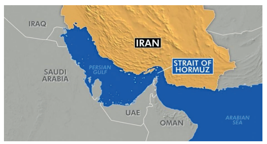
Figure 1. The Strait of Hormuz