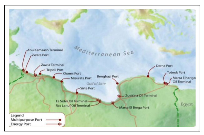
Figure 3. Libyan Ports.

With the outbreak of the war in Libya, western companies doing port development work here, but they could not complete their work. Italian contractors abandoned the 8 billion USD worth Benghazi port project and left the coun-