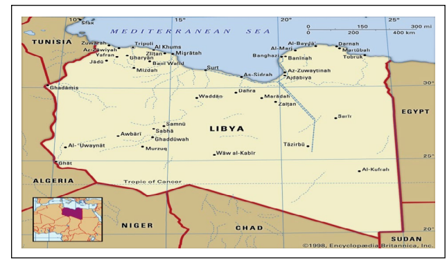
Figure 1 . Libya and Neighbourhoods.

Libya is an important country having oil reserves and all respective parties are looking for stabilization in Libya without military operation unless needed. Libya's eastern-based military leader Khalifa Haftar said his Libyan National Army (LNA) was accepting a "popular mandate" to rule the country, apparently brushing aside civilian au-