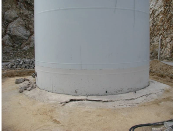
Figure 1 - Damage at the connection of the tower and the foundation of a WPP