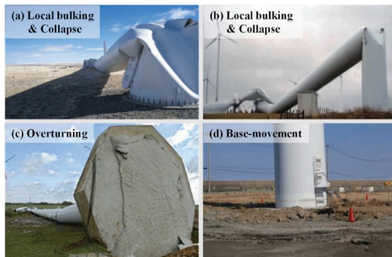
Figure 2 - Possible damage of WPP due to earthquake [16]