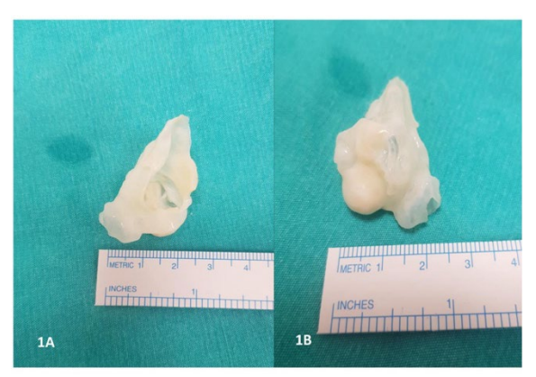
Figure 1. Resected parts of degenerated pulmonary valve and right coronary cusp of aortic valve.

transverse pulmonary arteriotomy, and transverse aortotomy were performed to obtain an adequate exposure. A pouch made by the tricuspid septal leaflet had covered the perimembranous VSD. Additionally, the right coronary cusp of the aortic valve and adjacent cusp of pulmonary valve were prolapsed due to the Venturi effect of chronic jet flow through the VSD (Figure 1A,1B). Moreover both cusps were adherent to this pouch. The pouch, prolapsed aortic right coronary cusp and adjacent prolapsed pulmonary valve cusp were explored and they were excised carefully (Figure 1A, 1B). The VSD was repaired using a polytetrafluoroethylene patch with a continuous 5/0 propylene suture (Figure 2).