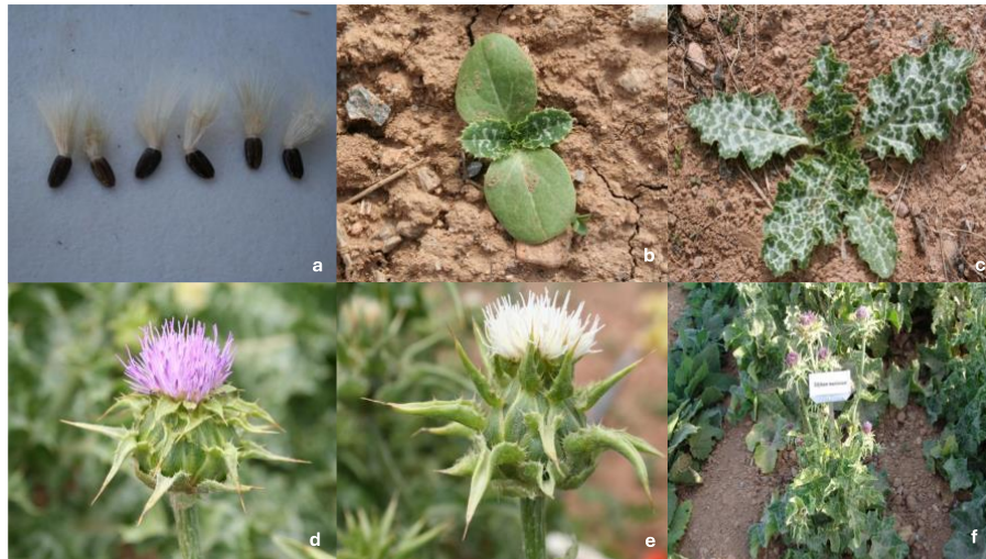
Figure 1. The botanical parts of the milk thistle: (a) achenes and pappus on the seed; (b) the plant seedling; (c) white spots on the rosette leaf; (d, e) flowers of milk thistle; (f) herbaceous plant.

to Baytop (1999), in Türkiye, the fruits of Silybum marianum are traditionally ground into a powder and mixed with honey. This mixture is used as a remedy for liver disorders, gallbladder disorders, and digestive system issues.