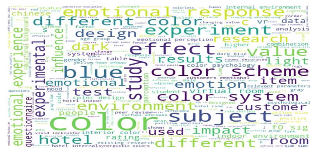
Figure 4. Wordcloud for Cluster 2

Figure 4 shows the word cloud for Cluster 2. In Cluster 2, words such as experience, emotion, response, value, and color stand out.