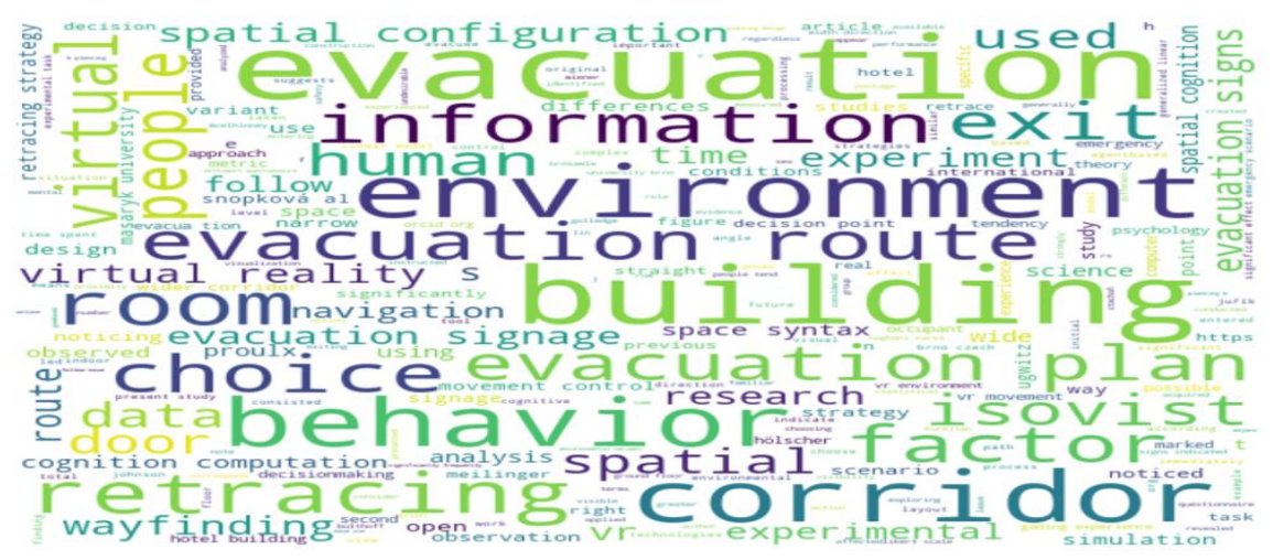
Figure 3. Wordcloud for Cluster 1

Looking at the word cloud for Cluster 1 in Figure 3, the words evacuation, signage, information, wayfinding, and environment are notable.