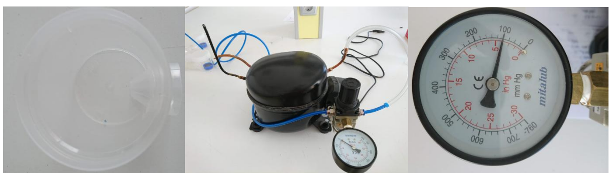
Fig 2 Lidded plastic container designed to be funnel-shaped for storing manures (left), the vacuum pump (middle), and vacuum pump's suction pressure (right)

The location of the experimental setup was kept fixed and the lidded boxes and the experimental setup were cleaned in each new trial. In the experiment, the manures were placed in lidded boxes moistened by 95%. The vacuum pump's suction pressure was adjusted to 0.132 atm (100 mm Hg) (Preliminary studies conducted prior to the experiment concluded that this pressure was the most appropriate). After the experimental setup was completed, the captured females were transferred to the box called the release box connected to the system and the study was started. A total of 10 replications were conducted with 10 females in each experiment.