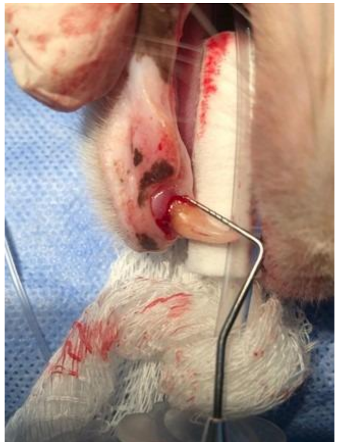
Figure 1. Clinical examination of tooth 404 with dental probe in a cat with tooth resorption

castration. A total of 35 cats older than 1 year with different breed, sex and body weight characteristics were included in the study, which were diagnosed with tooth resorption after clinical and radiographic examinations. After taking anamnesis for each patient, a comprehensive physical examination was performed and the findings were recorded on a standardized examination form. Blood samples were taken for hematological measurements (blood gas analysis, complete blood count and serum biochemistry profiles) and detailed clinical and radiographic examinations were performed under sedation or general anesthesia. Owners were informed in detail about the purpose of the study, the procedures to be performed and the potential risks, and a signed consent form was obtained indicating that they consented to the inclusion of their cats in the study. The diagnosis of tooth resorption was based on the results of anamnesis, clinical examination and intraoral radiographic evaluations (Figure 1).