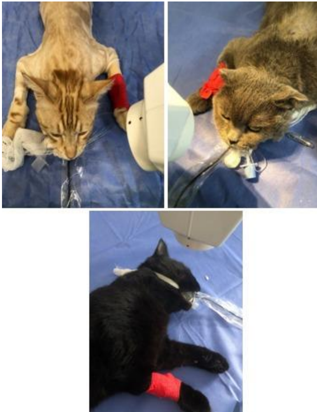
Figure 2. Dental X-ray

X-rays of each cat's teeth were taken and digitally recorded using parallel technique, bisection angle technique (17) and simplified technique (18,19) with Planmeca Pro-X Periapical X-Ray Device DC, Planmeca ProSensor RVG device (Size: 1) and Planmeca Romexis software patient tracking and imaging software program (Figure 2). The radiographic images were recorded on the examination forms by determining the types and stages of resorption for each tooth based on the anatomical and radiological classification system of AVDC.