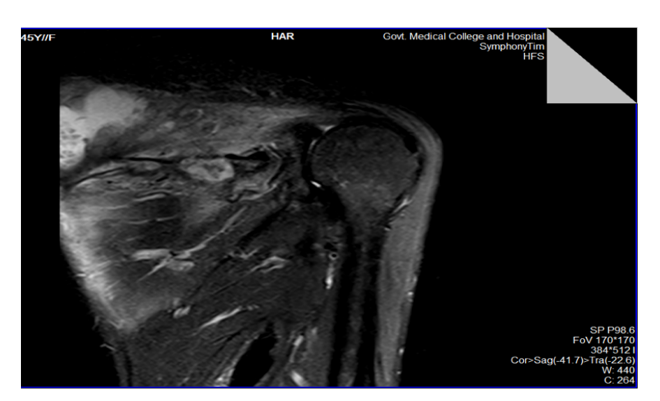
Figure 3. STIR weighted oblique coronal image of scapula showing scapular spine lytic lesion with associated edema in supraspinatous and infra-spinatous muscle and adjacent collection.

consistency. Laboratory investigations revealed raised ESR and positive qualitative C-reactive protein (CRP) in all the four patients.