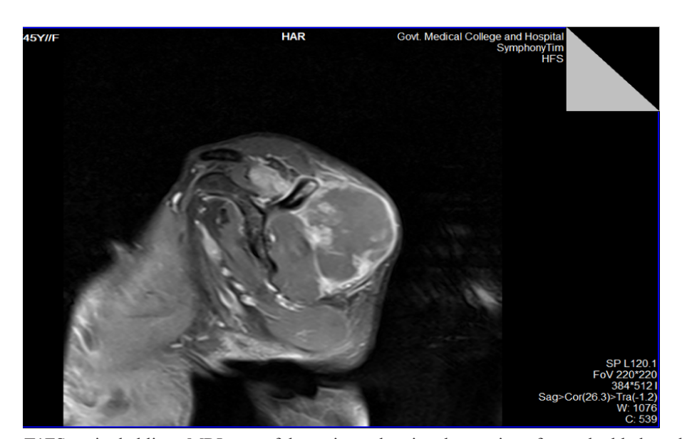
Figure 4. Post-contrast T1FS sagittal oblique MRI scan of the patients showing destruction of scapular blade and spine with associated collections in soft tissue.

CT scan was done in two out of the four patients. Both patients revealed lytic lesion involving the scapula (Figure 2). One patient showed involvement of scapular blade while in other both scapular spine and