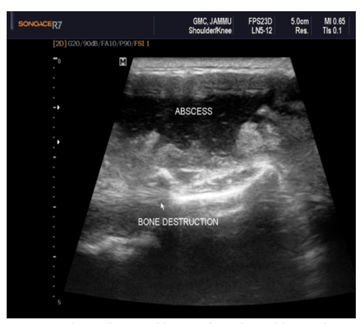
Figure 1. Linear ultrasound image of a patient with scapular tuberculosis showing scapular bone destruction with adjacent abscess in muscle.