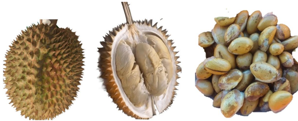
Figure 1. Durian and the seed

This study applied a Factorial Completely Randomized Design (CRD) with two main factors and two treatment levels, each of which was tested in three replications. The two main factors in this study were peeling of durian seed skin (with/without) and boiling of durian seed (with/without). Therefore, there were four samples in every replication, they were BP (boiled, peeled), BUP (boiled, unpeeled), UBP (unboiled, peeled), and UBUP (unboiled, unpeeled).