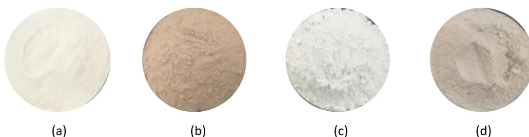
Figure 3. Durian seed flour with different treatment (a) BP, (b) BUP, (c) UBP, and (d) UBUP

1 Different letters indicate significant differences among samples within the same column ( p < 0.05 ). Data are means \pm standard deviation. 2 Boiled and peeled. 3 Boiled and unpeeled. 4 Unboiled and peeled. 5 Unboiled and unpeeled.