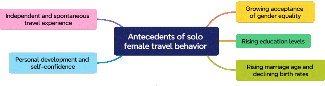
Figure 1. Antecedents of Solo Female Travel Behavior

Travelers such as Marco Polo and Ibn Battuta, known as adventurers and explorers in the earlier period, were generally males (Wilson & Little, 2005), whereas few females had the privilege or social status to travel. The modern interest in solo travel began in the 18th and 19th centuries due to increasing curiosity about the world. During the 19th century, some females did manage to travel alone, especially during the period seen as the golden age of travel (Robinson, 1994, as cited in Seow & Brown, 2018). In the 20th century, tourism marketers failed to recognize females' solo travelling, although it had gained an important place in the travel market (Bartos, 1982 cited in Seow & Brown, 2018). Currently, despite previous difficulties, solo female travelers are now part of the travel market. This has attracted the attention of researchers, leading to various definitions of female travelers. For example, Chai (1996, as cited in McNamara & Prideaux, 2010) defines solo female travelers as females who travel alone to a destination without being part of a package tour or a group.